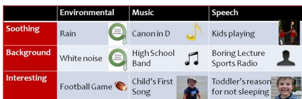
Figure 4: Classification of sounds using PTM. ReSound TSG falls into two of these categories.

The data suggest ReSound TSG can help provide significant improvement for veterans suffering from tinnitus. ReSound TSG offers the flexibility to address your patient's needs, for both hearing loss and tinnitus treatment. Future studies need to incorporate the type of counseling or tinnitus management being performed in conjunction with the ReSound TSG tinnitus tool, to better understand the interaction between the two.