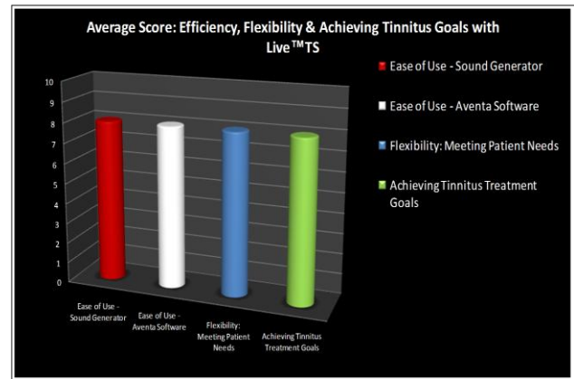
Figure 1: Average scores of different measured parameters of ReSound TSG.