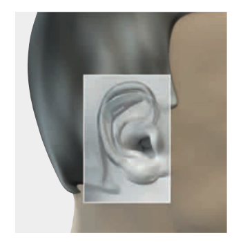
behind the ear