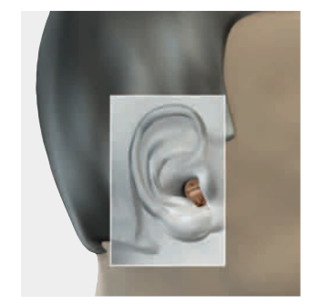
in the ear